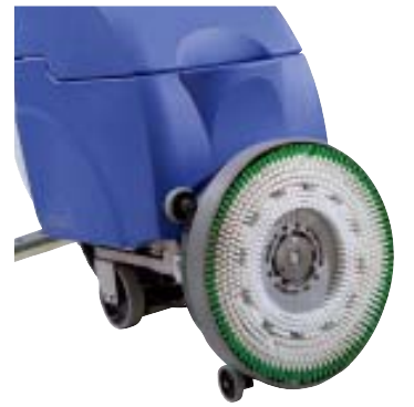
Patented Flip Up Head - Available on All Twintecs

And the structural foam brush deck is not only rust proof and durable, it carries a 10-year warranty.