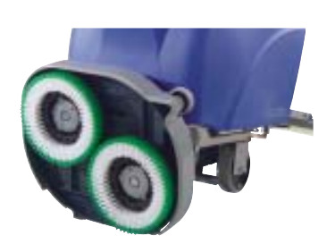
Patented Flip Up Head on all Models