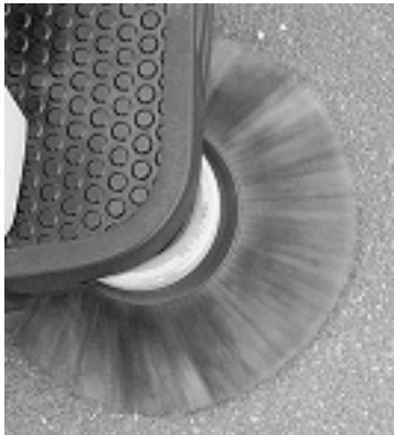
Easily adjust side broom speed for each broom

The Genius 1050 is a new category of rider vacuum sweepers. With its remarkably small size, it has all the features of the giants.