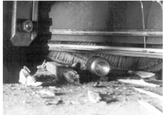
Foot pedal operated lift flap for sweeping up large debris