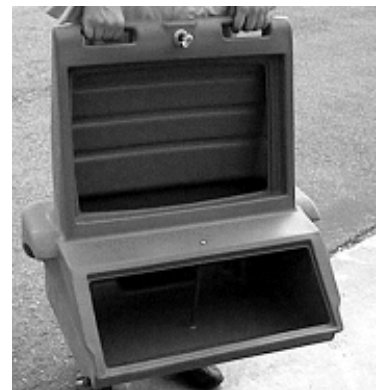
Large and light-weight debris hopper holds 2.5 cubic feet of debris and is rotationally molded polyethylene