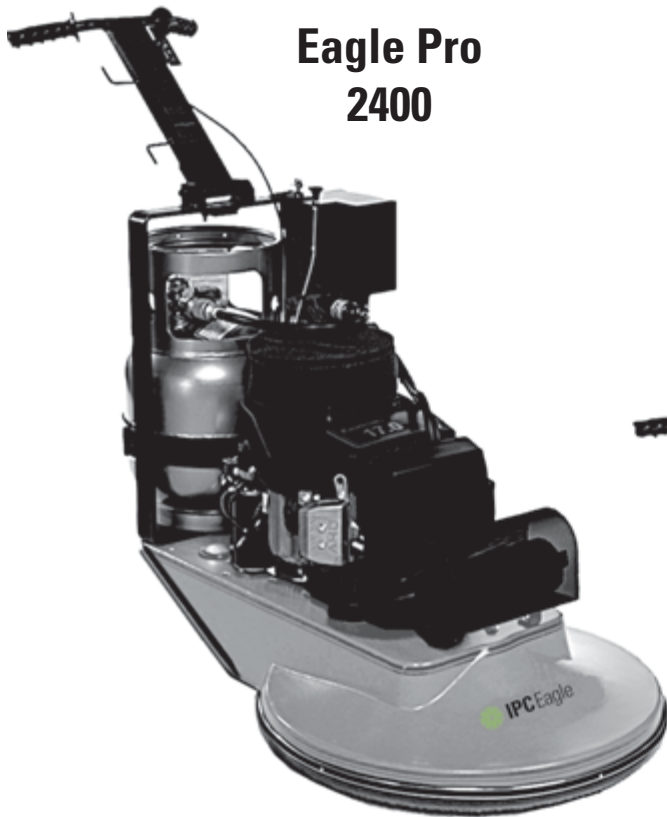
Eagle Pro 2400