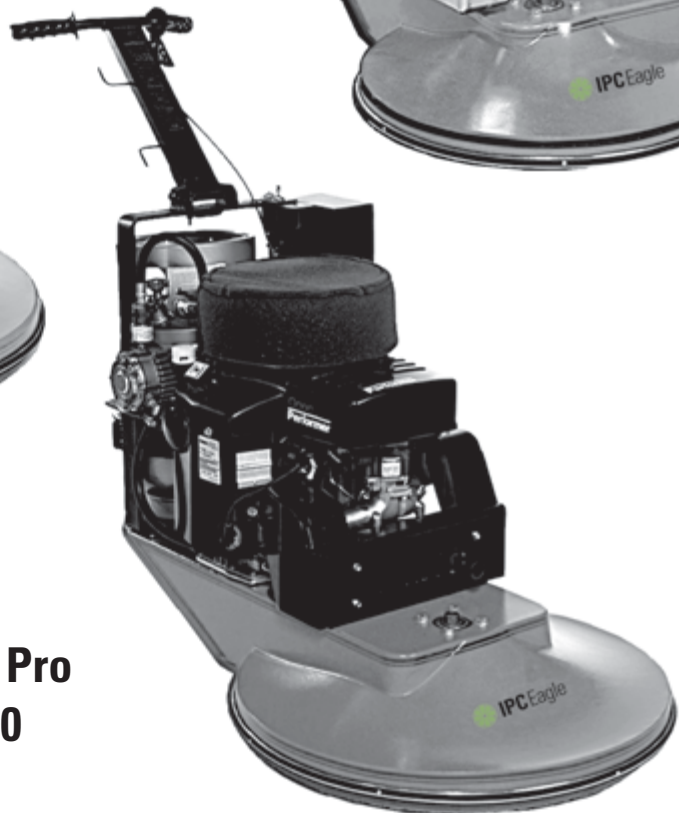
Eagle Pro 2700