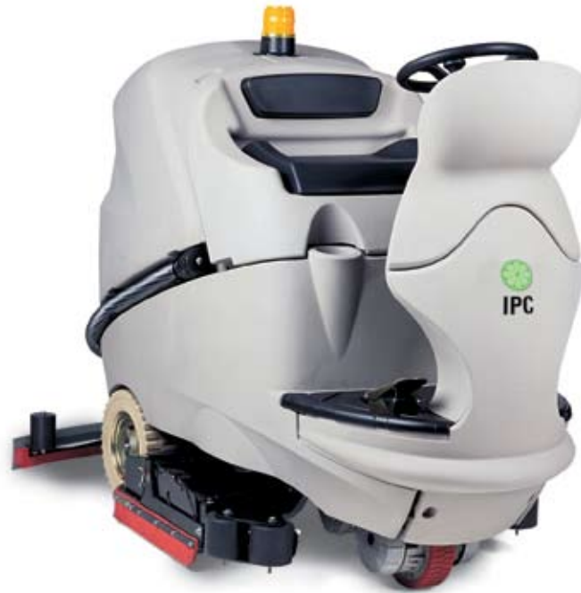
Cylindrical Brush Version