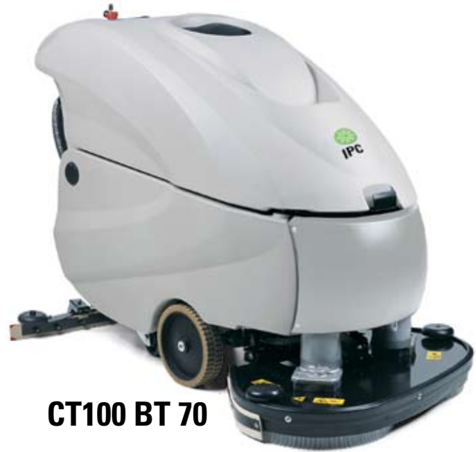
CT100 BT 70

Brush control with automatic "delayed" stop