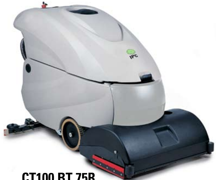
CT100 BT 75R

On board charger can be easily installed now or later