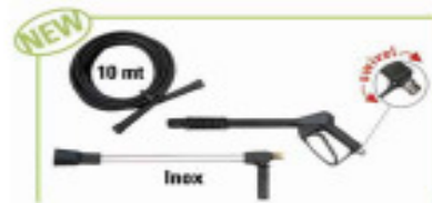
Dual Lance with professional gun, hose and swivel connector

The Sync is a professional grade, self contained, heavy duty hot water pressure washer. It offers a high quality 1750 RPM tri-plex pump with a brass head and long life ceramic plungers. The pump is coupled to a 4 pole continuous duty motor. The boiler is made with stainless steel and a treated double loop steel coil for efficiency. The machine is mounted on a steel frame with a tough rotomolded high density polyethylene body with resistance to rust and UV rays. There are 4 lift handles built in the frame and 4 large wheels for easy movement. The detergent and anti-scale tanks are built in. Anti-scale chemical is automatically metered with a level indicator. The control panel is 24V for safety. Total Timed Stop Control offers safety and efficiency, the machine shuts off with 30 seconds of inactivity, Total Stop after 20 minutes.