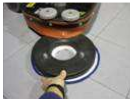
Pad and/or brush replacement without tools