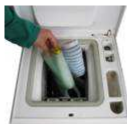
For even higher standards of hygiene the micro fibre pads can be washed in a standard washing machine.