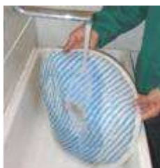
After use the micro fibre pad can be easily rinsed under a running tap.

The “Micro Scrub” system optimises the working time of the micro fibre pads that can be used in average for the cleaning of around 5.000 sqm. The pads can be easily rinsed under a tap and/or washed in a washing machine for at least 200 times, nearly 5 times longer than the duration of a traditional brush and 10 times the duration of a standard pad.